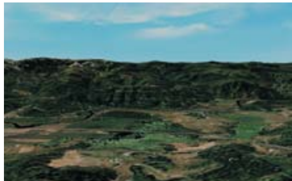
Geocentric databases support worldwide flight with no discontinuity, distortion.