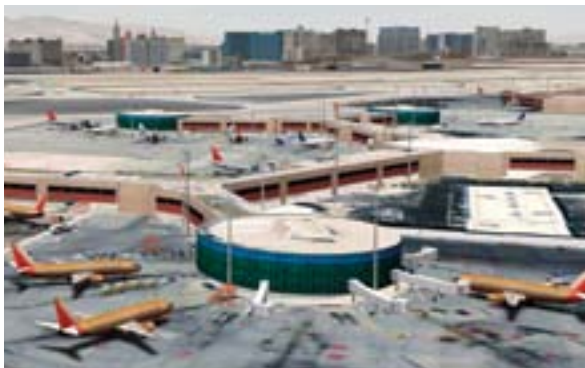
Training simulation visual depicts busy commercial terminal.