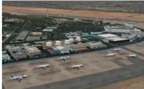
Photo realism delivers highest fidelity for maximum training benefit.