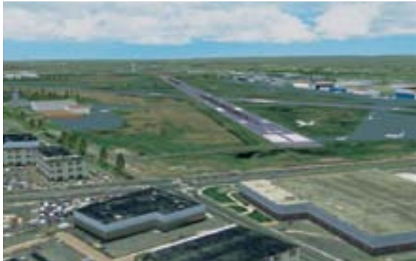
Worldwide database includes specific commercial airports.